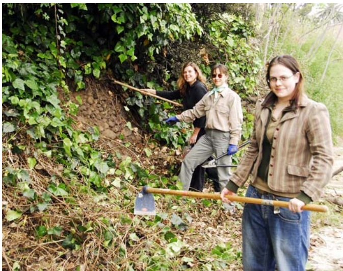
Discovering a hidden stone wall.

Nearly 50 volunteers donned their gloves and picked up tools to clear trash and weeds from this blighted entrance to our community, in an event that brought together members of the Mount Washington Association, Mount Washington Homeowners Alliance, Self-Realization Fellowship, and friends from the broader local Arroyo community.